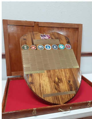
Memorial Plaque SLCCV Veterans