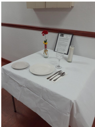
The Forgotten Man Table